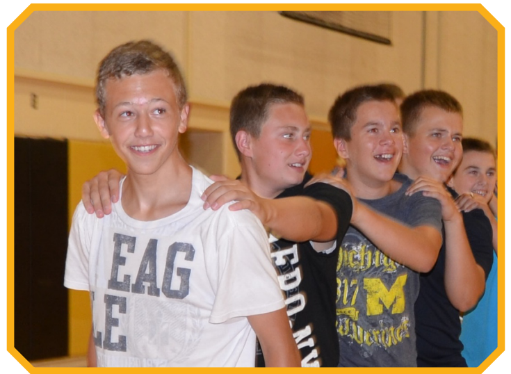
Freshmen now Seniors!